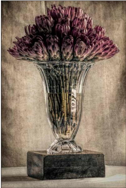
Proteas, National Flower of South Africa Cape Grace Hotel, Cape Town, South Africa, 2015 Photographed with Fuji X Pro I Commissioned by M&A Design for the Cape Grace Hotel